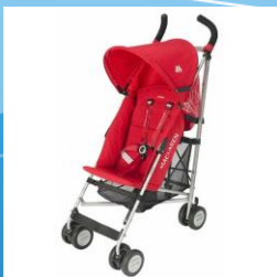
Stroller: $10 Flat Rate

Show Days: 1h Before/After & Show Hours Move In/Out: 10am-5pm