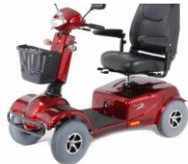
Scooter: $10/hour (Max. $60/day)

We'll do the packing and take care of all the details too, getting your shipment to your desired destinations.