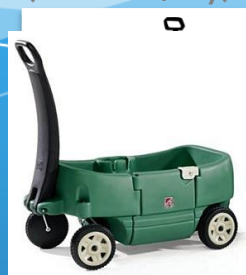
Wagon: $10 Flat Rate

A value added service on your show floor