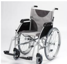
Wheel Chair: $5/hour (Max. $30/day)